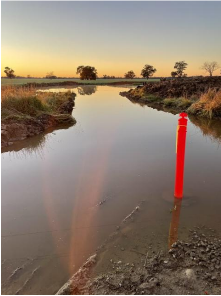
Lat 8 - Borrow Pit – not looking too flash!