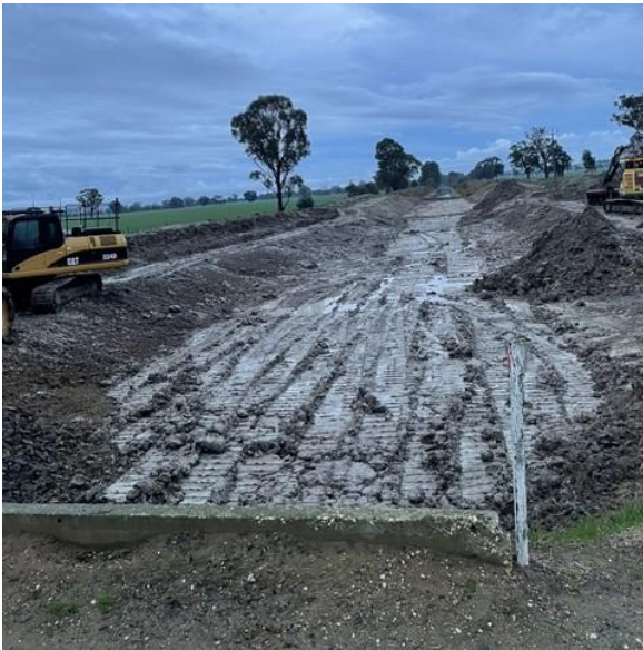
Basically, it's a mess! Lots of sunshine please.