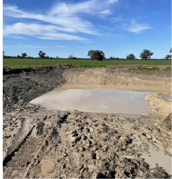
Lat 8 - Borrow Pit ..... improving.