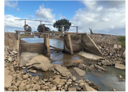
Work has started. Where am I?